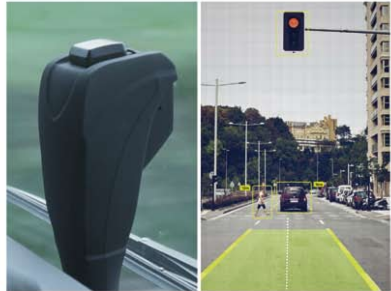
Magic Eye - Driver assistance system